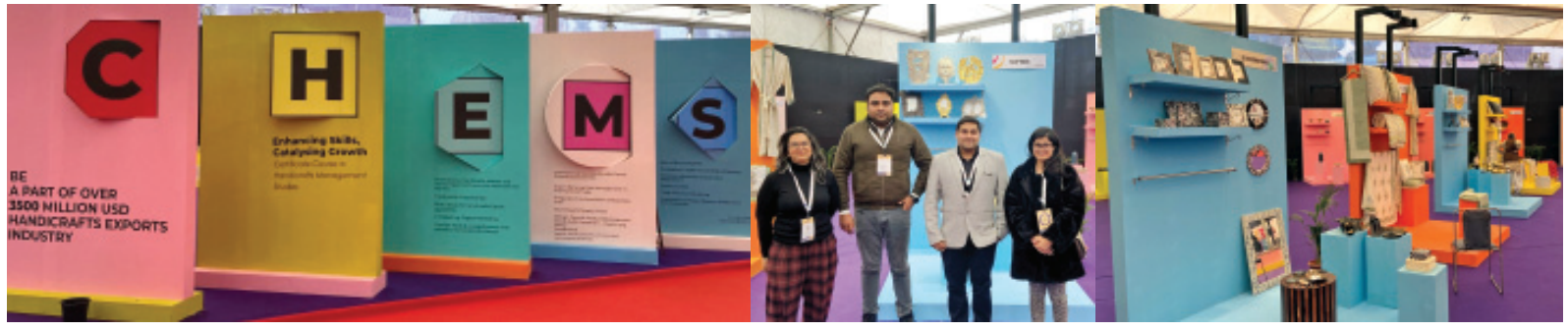
The CHEMS showcase at IHGF Delhi Fair-Spring 2024 with products from some of its alumni who are now exporters

Centre for Handicrafts Exports Management Studies (CHEMS) showcases achievements